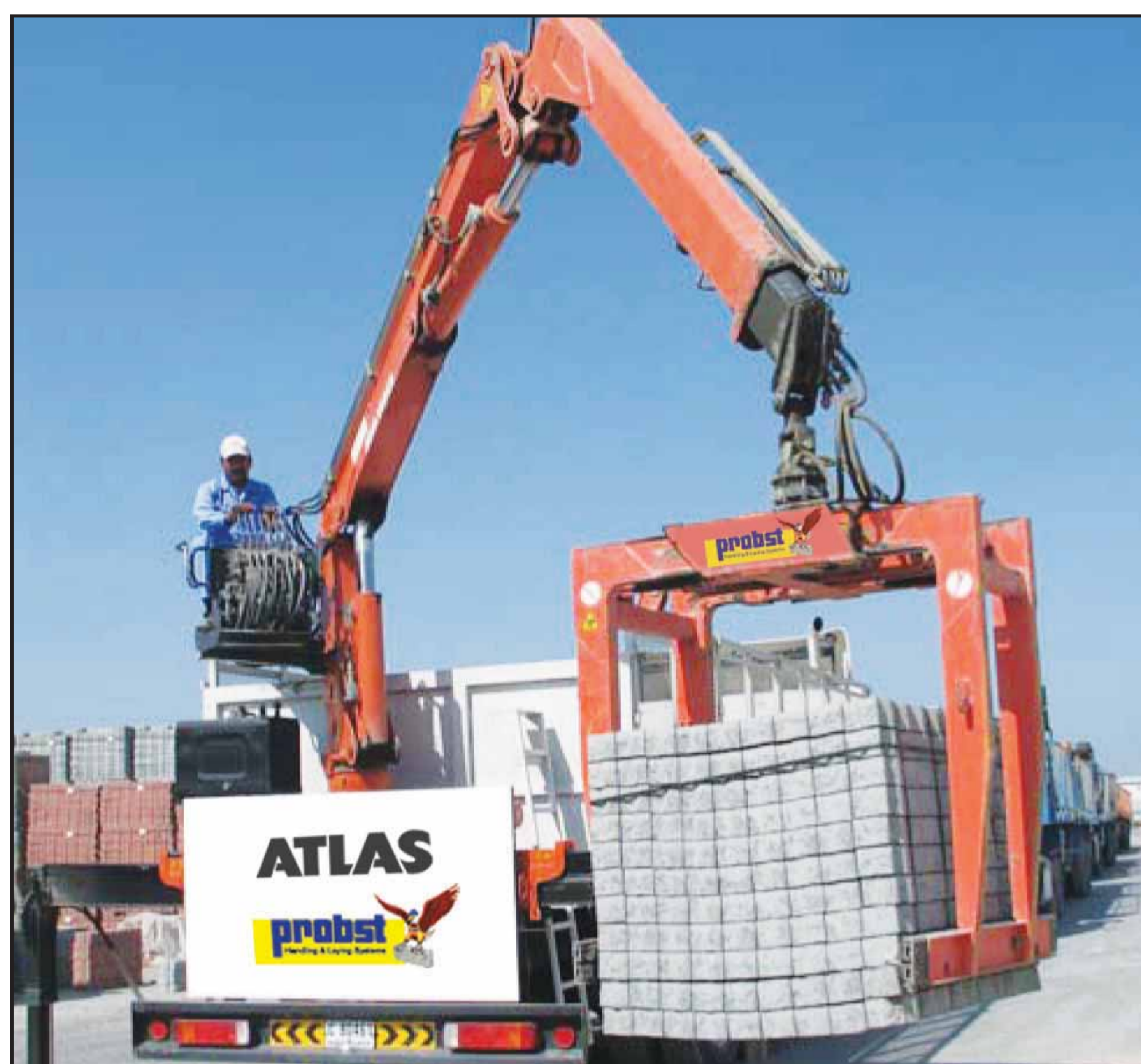
Truck Mounted Crane