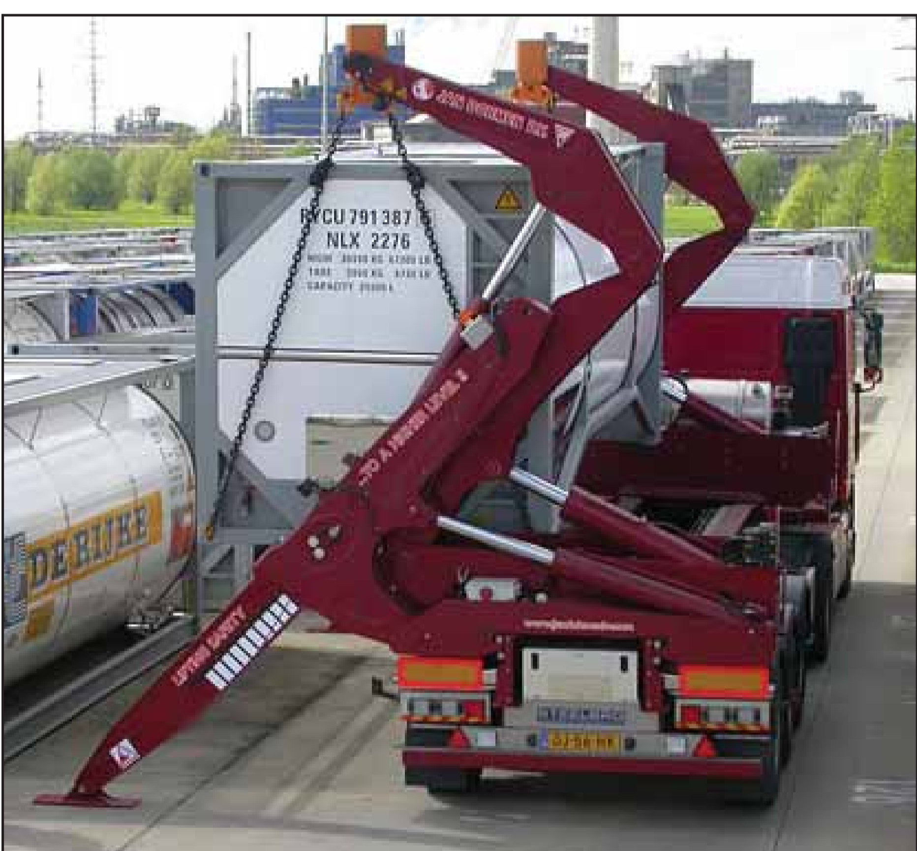
Container Handling Solutions